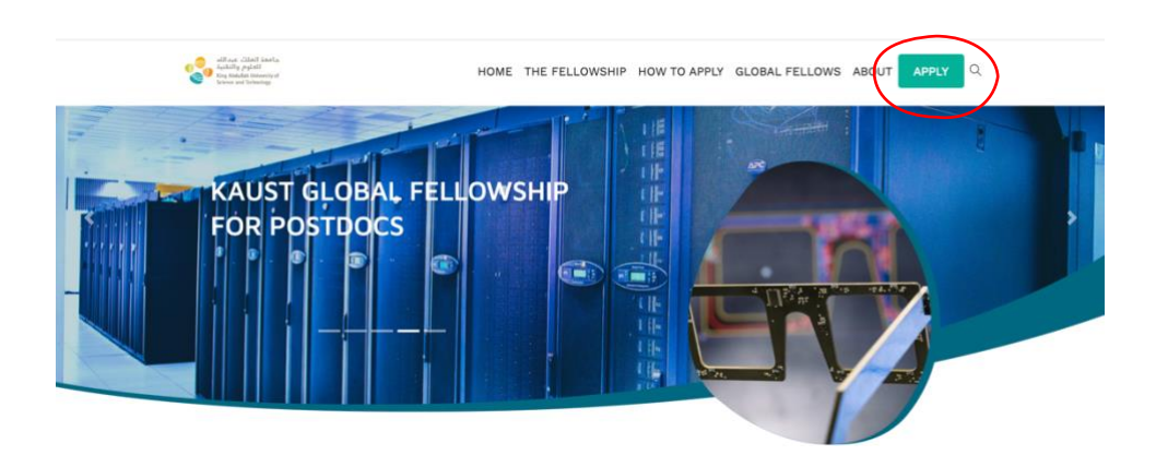
Step 1. If you are an applicant, click the APPLY button on the main page.

Step 2. From the <u>application page</u> read the guidelines carefully and click the "Apply now" button